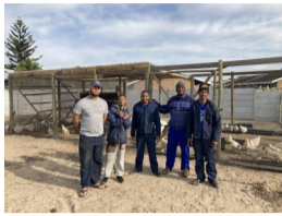
News From The Sports field