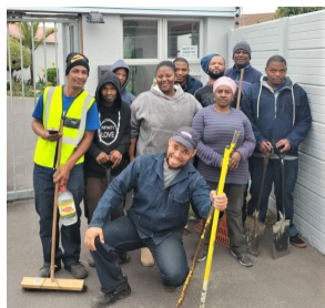
Mandela Day Activities