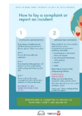
Streetscapes Safe Guarding Policy