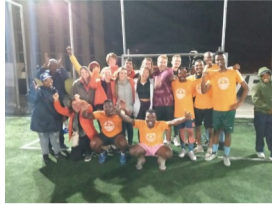
News From The Sports field