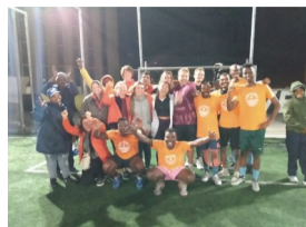
News From The Sports field